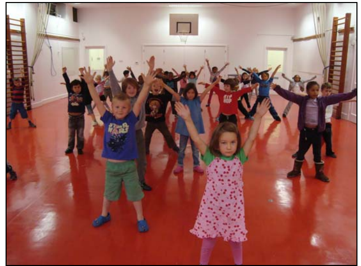
2RV in the newly refurbished gym

You may well have noticed some of the changes to the school that have taken place over the summer period. Besides much redecoration, the most significant changes have been to the gym and the nursery and reception classrooms. The gym now has an acoustic ceiling, air conditioning and a huge storage cupboard, leaving the space free for PE, dance and drama activities. The nursery and reception classrooms have been completely modernised, with new flooring, toilets and kitchen.