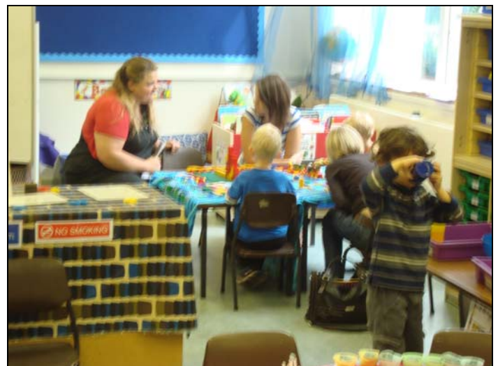
Reception children on their first day at school