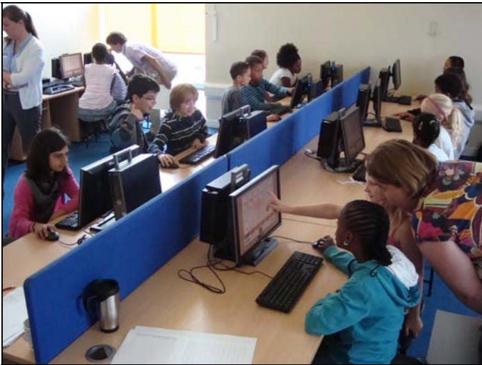
Year 6 are first to use the new computers